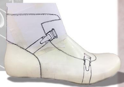
Forme: TOM BIO-1