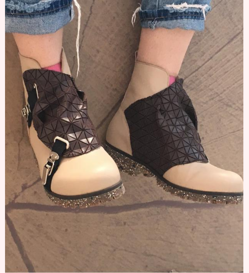
LEA BOURGET - CHOLET